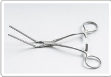
PO352026 : CLAMP DE BAKEY SUBCLAVIAN FEMORAL POPLITEAL CAROTID 18CM