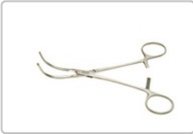
PO352029 : CLAMP DE BAKEY FEMORAL POPLITEAL 16.5CM