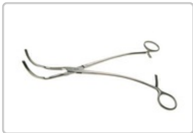
PO353006 : CLAMP DE BAKEY SPOON SHAPED JAWS