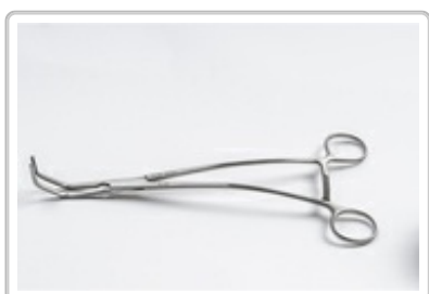
PO353013 : CLAMP DE BAKEY TANGENTIAL 25CM