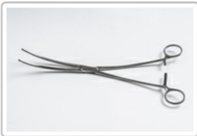
PO353004 : CLAMP DE BAKEY AORTA ANEVRYSM 31CM