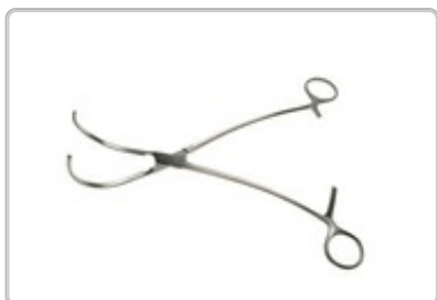
PO353008 : CLAMP DE BAKEY 26CM