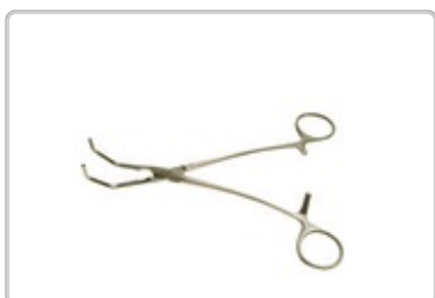
PO353012 : CLAMP DE BAKEY TANGENTIAL 20CM