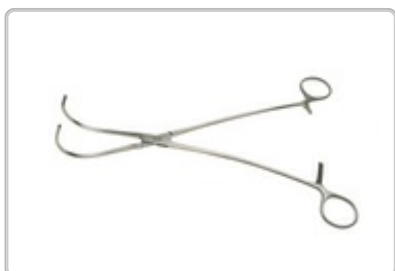
PO353011 : CLAMP DE BAKEY SEMB LIGATURE CARRYING 25.5CM