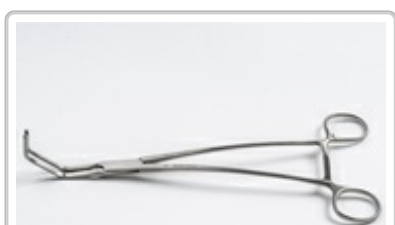
PO353014 : CLAMP DE BAKEY TANGENTIAL 26CM