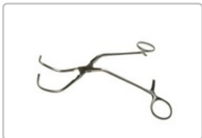
PO353007 : CLAMP KAY LAMBERT FOR ANASTOMOSIS OF ABDO & THORACIC AORTA