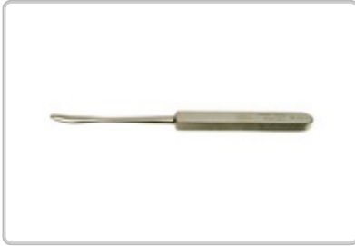
PO346022 : SPATULA LEBEAU FLAP ELEVATOR 19CM