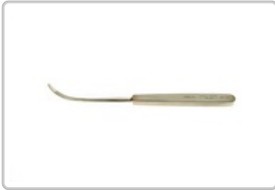
PO346023 : DURA DETACHER CAIRNS 19CM