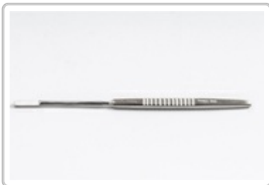
PO346039 : TENOTOME 20CM POINTED