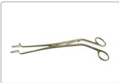
PO211024 : ENDOSPECULUM FORCEPS KOGAN WITHOUT RATCHET 24CM