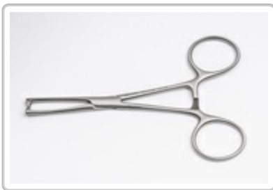
PO211035 : FORCEP MUSEUX 18CM