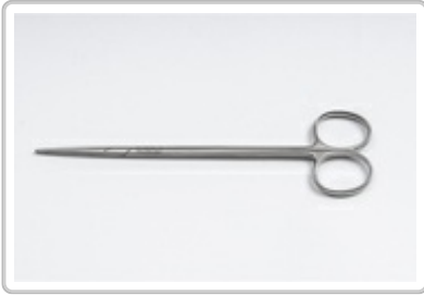
PO146002 : SCISSOR TOENNIS ADSON CURVED VERY FINE 17.5CM