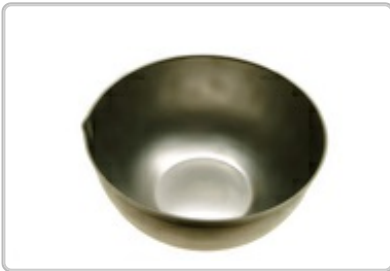
PO471002 : CUP OF STAINLESS STEEL WITH FLAT BOTTOM AND BEAK 30MM