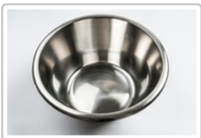
PO471013 : CONICAL TRAY OF STAINLESS STEEL DIAM 200MM