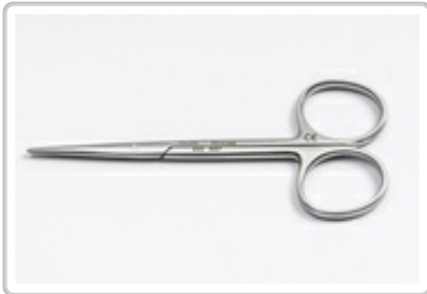
PO141200 : SCISSORS LEXER-BABY STRAIGHT L=10,5CM