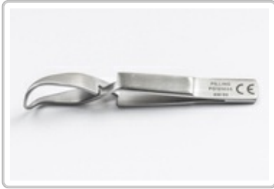
PO121005 : TOWEL FORCEPS CRABE WITH SPRING L=9CM