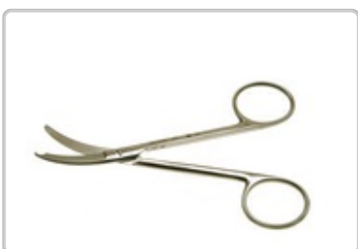
PO141497 : SCISSOR SPENCER ANGLED 13CM