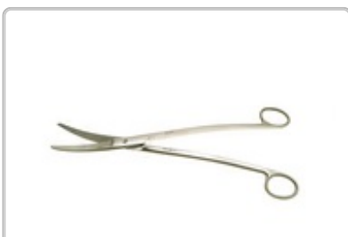
PO141351 : SCISSOR SIEBOLD S CURVED 24CM