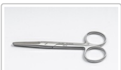
PO142102 : SCISSORS OPERATING STRAIGHT BLUNT L=10,5CM