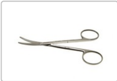
PO141209 : ENUCLEATION SCISSOR CURVED 13CM